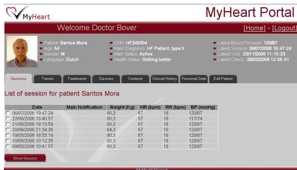
Fig. 4: Professional Interaction

The Professional interaction is based on a web access through the Cocoon Framework and a CFORM based visualization, as shown in the following figure: