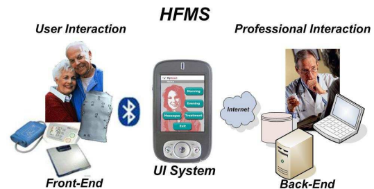
Fig. 1: HFMS overview

Heart Failure Management System consists of three main elements: a) The Front-end, b) the User Interaction System and c) the Back-end. The following figure sketches the global system: