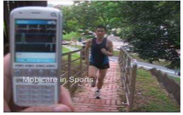
Figure 4: MobiECG Processing ECG Signal in Real Time

In the second experiment, we have attached the ECG sensor onto a person as a test subject. The test subject was then asked to go through a series of non-strenuous activities like moderate jogging and stair climbing shown in Figure 4. The ECG signal though received, processed and recorded on the mobile phone was not sent to the Mobicare Monitoring GUI as none of the two alarm conditions was fulfill.