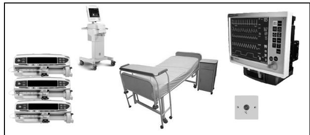
Figure 1. Patient Care Devices at the point of care (ICU)

In addition to PCD alarms, patients themselves are also able to generate an alarm by pressing a patient alert button.