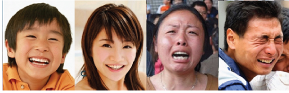
Fig. 1. Excerpt of a sequence of stimuli. The first two are smile facial pictures and the last two are cry facial pictures.

others pictures were taken of people who recently lost family members. Pictures were resized to be of similar size.