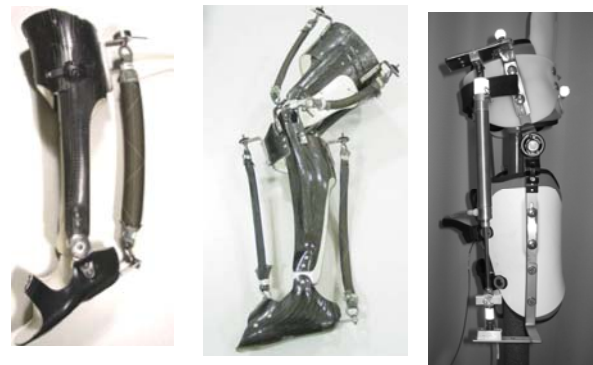
Figure 1. University of Michigan Human Neuromechanics Laboratory exoskeletons. Above left: ankle exoskeleton with artificial pneumatic muscle providing plantar flexor torque. Above middle: knee and ankle exoskeleton with artificial pneumatic muscles providing extensor and flexor torques. Above right: hip exoskeleton with a pneumatic cylinder providing extensor and flexor torques.

To study robotic assistance to dorsiflexion only, we designed a lighter weight exoskeleton composed of just a shank cuff and a foot section without a hinge joint [14]. Because peak dorsiflexor torque during gait is substantially less than peak plantar flexor torque, we were able to use polypropylene for both shank and foot sections. A steel bracket was attached to the anterior portion of the shank section and a steel hook to the dorsum of the foot section for connecting the pneumatic muscle. When activated, the pneumatic muscle provided approximately 20 Nm peak dorsiflexor torque during human walking (~130% of the peak biological net muscle torque).