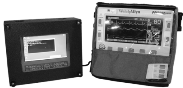
Fig. 2. Protective cage detached from the Propaq. LEFT: Bottom view of the cage, showing the touch screen of the ruggedized Switchback PC. RIGHT: Propaq 206 vital-signs monitor.

We identified four primary requirements for the software components in our platform. 1) The software must reliably capture and store data as they are streamed in real-time via a serial interface from the Propaq to the PC. Random disconnects, corrupt data packets, and transfer delays must all be handled gracefully. Under no circumstances can the software interfere with the normal function of the monitoring equipment. 2) The captured data should be made available for analysis as quickly as possible in a format that accurately represents wall-clock time, and properly accounts for missing data caused by communication faults. It is also essential for all physiologic measurements to be accurately synchronized on a common timeline, regardless of when each sensor is first connected to the patient. 3) As the primary goal of this platform is to test and compare various physiologic data analysis methods, it must provide facilities for quickly adding, removing, and modifying algorithms before sending the system back into the field. 4) The need to modify existing algorithms for compatibility with the system and the effort to iteratively enhance previously tested algorithms should be minimal. Accordingly, the software environment for data analysis should support a large library of mathematical functions and allow for quick prototyping.