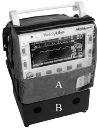
Fig. 1. Assembled prototype of the proposed system (under development in collaboration with Intelesense Technologies, Milpitas, CA). Propaq 206 vital-signs monitor “A” is mounted on top of the protective cage “B,” which contains the ruggedized Switchback PC.

limitations on hardware and software. Hardware components must have a small footprint to fit inside limited helicopter space and be light enough for direct attachment to the Propaq. We identified the bottom of the Propaq to be the only available location for attachment of a pedestal-like cage to house and protect the ruggedized PC (Fig. 1). The challenge in this design was to account for the inevitable stresses of real-world use, such as withstanding a drop of several feet with the weight of Propaq on top and being exposed to heat, cold, rain, mud, and other elements. Furthermore, adequate ventilation was needed to cool the PC components inside without exposing them to environmental hazards. This was achieved by creating openings in the cage as far away from the ground as possible.