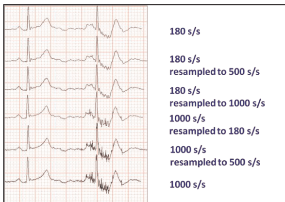
Figure 1. Effects of resampling ECGs recorded at the original sampling rate of 180 s/s and 1000 s/s

QT intervals were measured in ECG sets at their original sampling rate and after resampling to 180 s/s, 500 s/s and 1000 s/s. The effects of resampling ECGs recorded at the original sampling rate of 180 s/s and 1000 s/s is shown in a representative tracing in Figure 1.