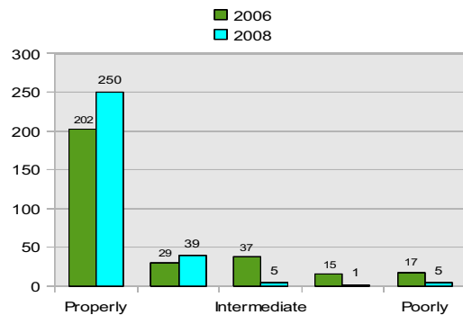
Figure 2- Quality performance

The second sample completed in 2008 showed that 96.33% of terms were properly represented, 2% were poorly represented and 1.67% could not be determined (Figure 2).