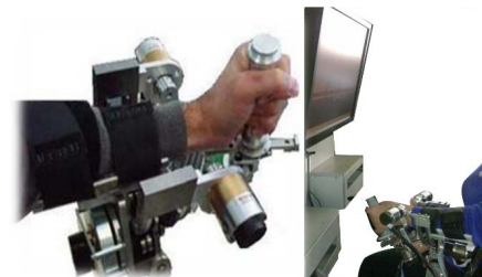
Figure 1. Experimental setup: IIT Wrist Robot (left panel) and mounted on top of the planar BdF2 robot (right panel).

The experimental setup (figure 1) consists of a wrist robotic exoskeleton with 3 degrees of freedoms (DoF) mounted on top of a planar 2 DoF manipulandum (BdF2, Celin Ltd, La Spezia, Italy) [9]. Although it can be used for a variety of assistive tasks, in this study the planar robot is only used for precisely supporting/positioning the wrist. The wrist robot