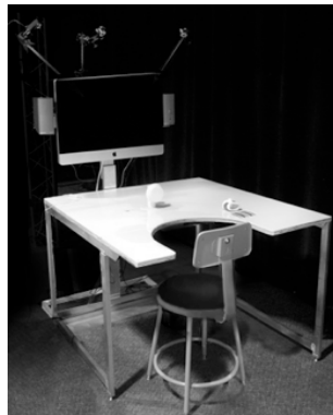
Fig. 1 HAMRR media center and table

The table is constructed from an aluminum tube frame and 8 ply MDO. The tabletop is 103 cm by 110 cm, with a height of 75 cm. The detachable table is lightweight and can be removed from the media center. The table has a semi-circular cutout, which is designed to provide support for the hand and arm throughout movements. The left arm support is hinged to provide a means for the participant to get in to and out of the chair. The table leg under the hinged arm acts as a grip to help support the participant as he or she stands up or sits down, as seen in Fig. 1.