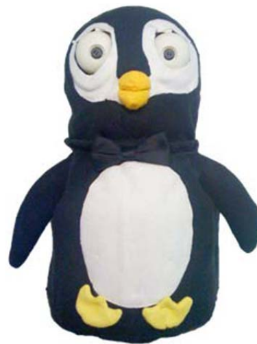
Fig. 1: Current prototype of the PABI humanoid robot. The robot is designed to be low cost, durable, expressive, and capable of meaningfully interacting with an autistic child.

The proposed system is designed to serve as a tool for both diagnosis and therapy. The robot may simplify the job of diagnosing or treating patients for more highly trained therapists, allowing them to see more patients per day. Further, the robot will assist in providing quantitative measures for initial assessment and charting of treatment progress. For example, one of the behaviors a provider will measure in terms of social cues is gaze direction.