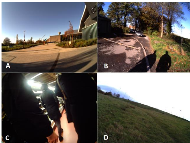
Figure 2. Examples of photographs from the wearable camera in four different walking conditions; A – normal walking, B – walking on a rough surface, C – walking in a busy area and D – walking up a hill.

Figure 2 shows examples of photographs from the wearable camera in four of the different walking conditions. The blind-folded walking condition is not shown.