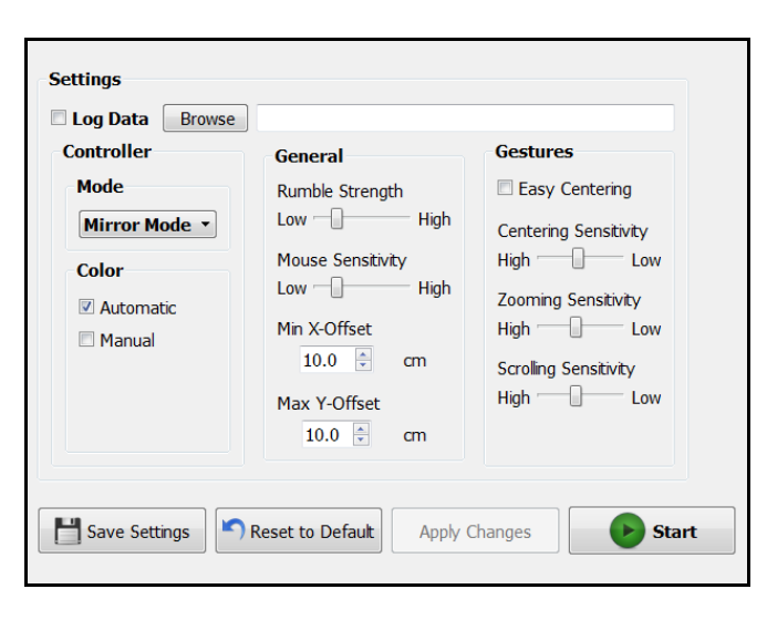
Fig. 3. PlayStation Application