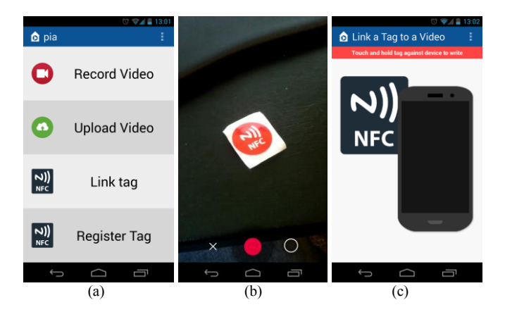
Figure 1. Screen shots of the menu (a), video recording (b) and tag linking (c) interface of the implemented PIA app.

Caregivers using the PIA system affix NFC tags to objects in a home (e.g. a washing machine). Then, using a smart device that has the PIA app installed, they record a video illustrating how to complete an activity associated with a specific NFC tag. After recording this instructional video the caregiver uploads the video clip to the PIA cloud and links the tag to the video via a reasoning system. The PIA app provides a simple interface and workflow for caregivers. This interface is shown in Figure 1.